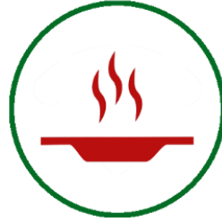
Breakfast & Dinner