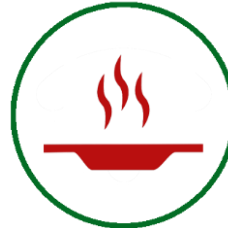
Breakfast & Dinner